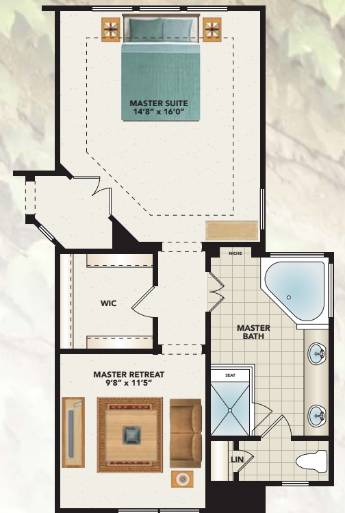
OPTIONAL MASTER RETREAT