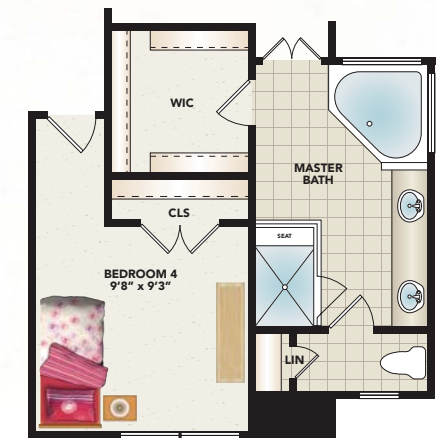
OPTIONAL BEDROOM 4