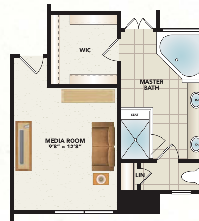
OPTIONAL MEDIA ROOM