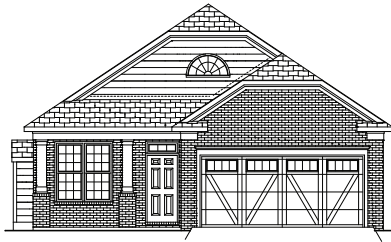
THE LANCASTER B