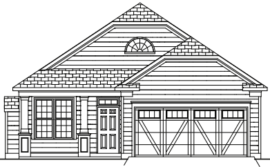
THE LANCASTER A