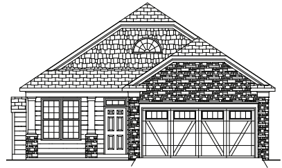
THE LANCASTER C