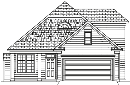
THE HUDSON A