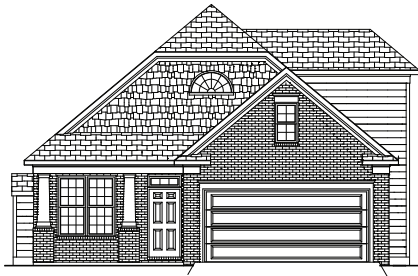
THE HUDSON B